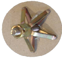
Five Way Expansion

An all metal cavity, expanding cavity fixing suitable for use in plasterboard and any other cavity application. With 5 expanding legs the Hollow Wall Anchor provides the maximum bearing area to withstand lateral and shear loads