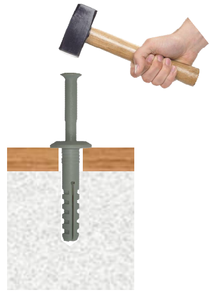
Insert Nylon Nailplug and hammer in expansion pin