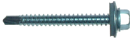
Metalfix No.3 & No.5 point with 16mm or 19mm washers

Bi-Metal Grade A2 Stainless Steel screws with hardened carbon steel drilling point