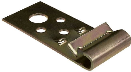
Part Number VFC1